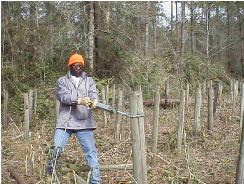
Example of 50 lb Pull test

The data from the evaluation was statistically analyzed using a variety of techniques (Weibull Distribution and 90% Confidence Interval at the 60 th percentile) and the results illustrate average life spans for many of the preservative treated pine posts. The average treated and untreated pine posts life span can be seen in the following Tables and Figures..