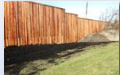
Timber Sound Walls

CuNap COPPER NAPHTHENATE WOOD PRESERVATIVE