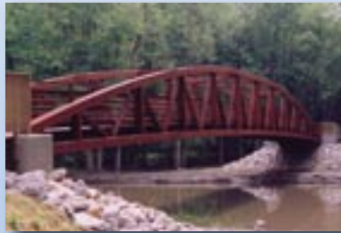
Steel Recreation Bridges