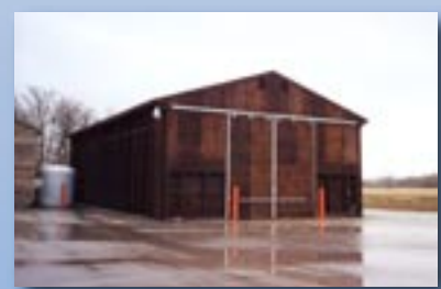
Salt Storage Buildings