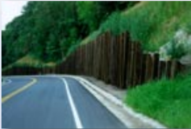
Timber Retaining Walls

The Wheeler family of companies has been manufacturing and supplying steel and timber products for the construction industry for more than a century. Please contact us for information on our other products and services.