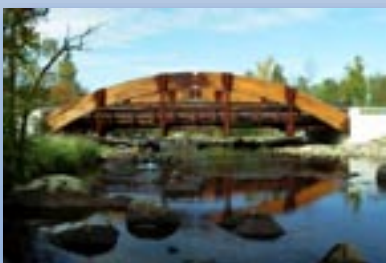
Timber Vehicle Bridges