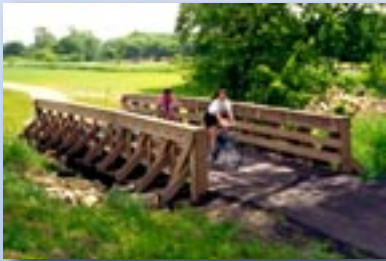
Timber Recreation Bridges